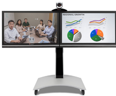
Dual 42" monitor configuration (Shown with optional caster kit)