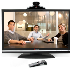
Table top media center (Shown with HDX 6000 view media center)