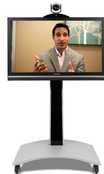
Single 42" monitor configuration