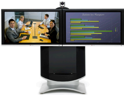
Dual 50" monitor configuration