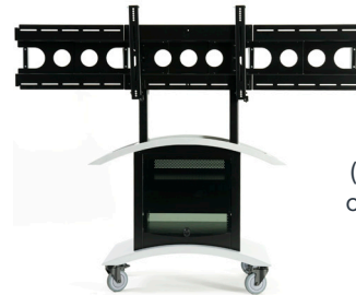
(Shown with optional dual display kit)